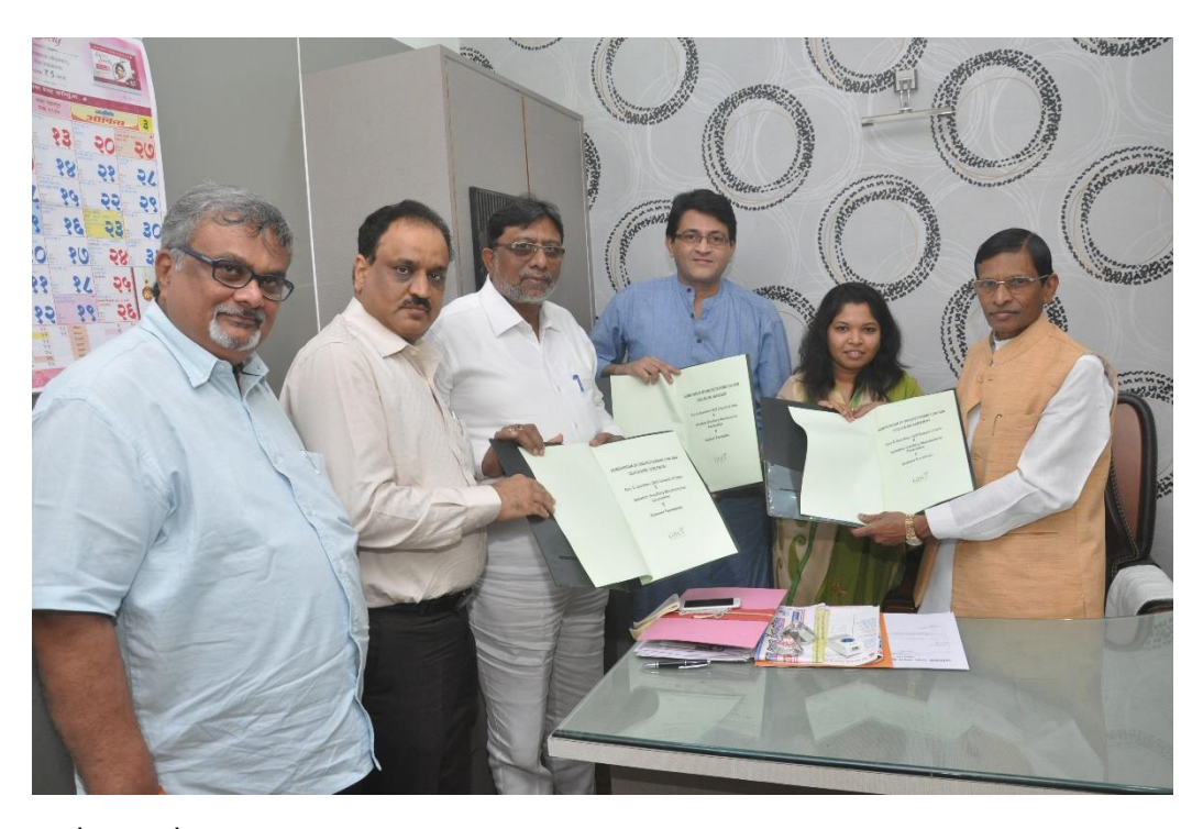
16th & 17th December 2015: ASAP Skill Conclave

According to the MoU, GJSCI shall help in training and certifying 4000 Tribal girl child by extending technical support and providing manpower for training the trainers as well as trainees. It will help in building and upgrading technical facilities to global competitive standards. The role of IJMA would be to provide a decent quantum of work to the tribal women on a continuous basis. It will also offer job work based on availability of requisite manpower with the help of GJSCI. On the other hand Aasmant Foundation shall help in mobilizing eligible candidates for imparting skill training to the 'Tribal Girl Child' for Manufacturing / Assembling of the Imitation / Fashion jewellery products. It will also form a 'Cooperative society' 'Bhachatghat' to facilitate the financial transactions occurred due to the manufacturing job work undertaken by the tribal.