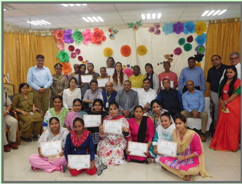
will earn money while they're working in the jail.

With an aim to transform the lives of Jail Inmates by skilling them and eventually emerging them as a reformed citizen, Project Rupaantar an initiative by GJSCI recently certified the first batch of Tihar women inmates.